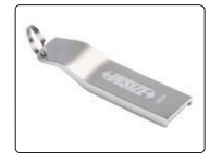
software flash disk (included)